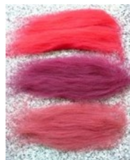
COASTERS and will take

Be adventurous in 2018! The last brown bag AA ART SESSION is HAND-FELTED