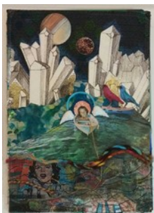
My Blue Boat Home