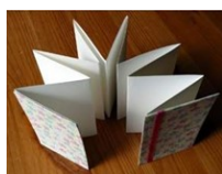
cordion Greeting Cards Art Session/MACMH Fund-raiser in November. Attendees created uniquely wonderful accordion cards

make a more unique and/or complex piece. Why not a collage of small, hand-felted bits and pieces...? Hmm...now, that sounds pretty cool. Affirm to yourself, "Creative ideas flow to me and from me freely and easily. I am truly creative!"