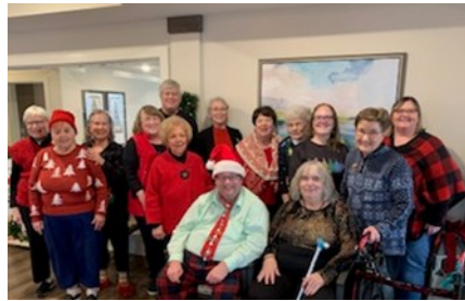
Merry Christmas and Happy 2024 from Beta Sigma